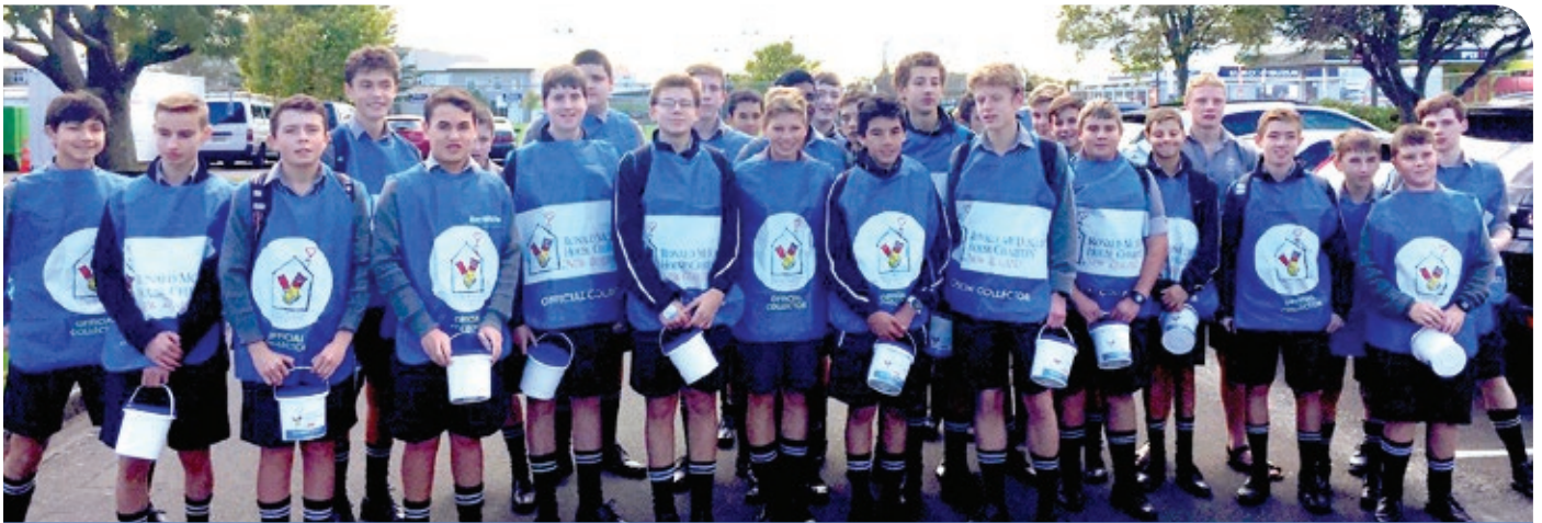
Last year Palmerston North Boys collected together with McDonald's Palmerston North