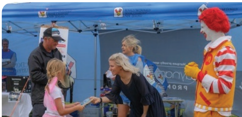
Prizegiving at the Orewa Fun Run/Walk