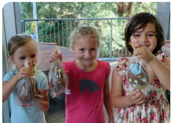
Easter treats for the families at the Houses

Thank you to the many restaurants throughout the country that ran Easter raffles. We know how much work, time and effort goes into these.