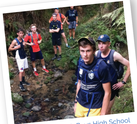
Palmerston North Boys High School