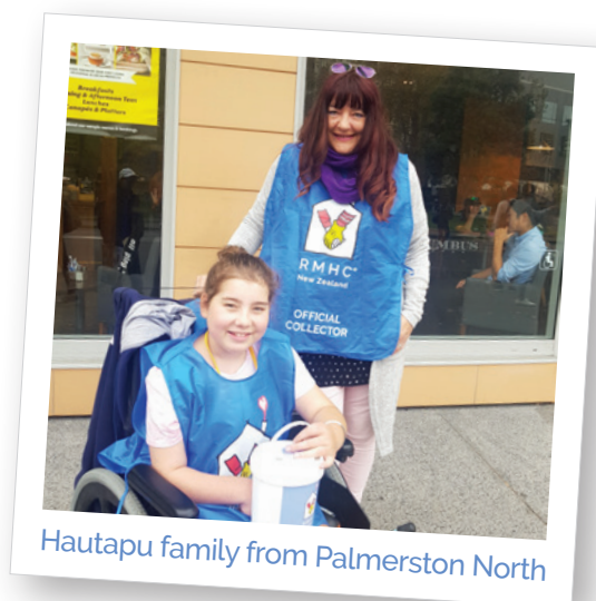
Hautapu family from Palmerston North

We have collection buckets, bibs, pamphlets, balloons, downloadable posters and thank you stickers and cards that are available for you to use. Just get in touch with us, and we'll post these to you or provide a link to download. We can also provide you with a letter of support which can help when approaching local companies.