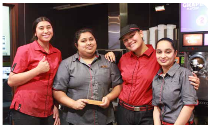
Proud crew from McDonald's Airport Departures

For the 11th year running, McDonald's Taupo has once again reigned supreme when it comes to restaurant customer donations. In 2017 their customers donated a grand total of close to $7,100. We believe the success is a combination of training crew to thank customers, having franchisees and managers that inspire the whole team to get behind fundraising and of course the generosity of the local community.