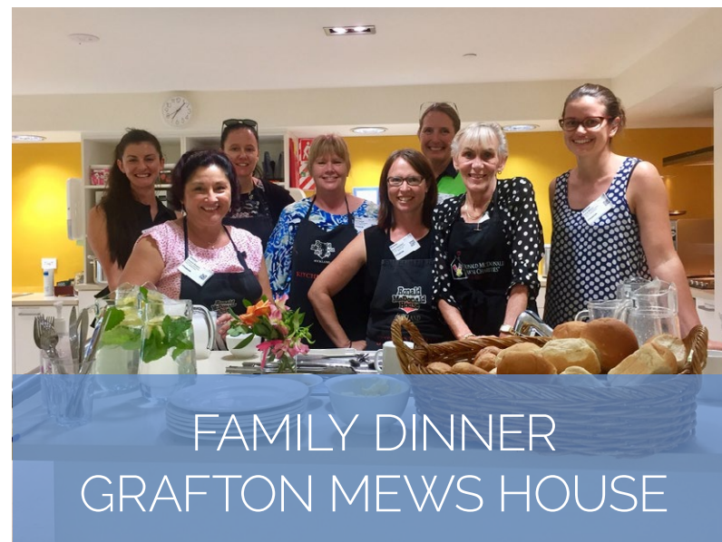
FAMILY DINNER GRAFTON MEWS HOUSE

Cost: $800 (incl. GST)* to cover food costs