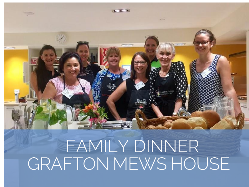
FAMILY DINNER GRAFTON MEWS HOUSE

Cost: $1,000 (incl. GST)* to cover food costs